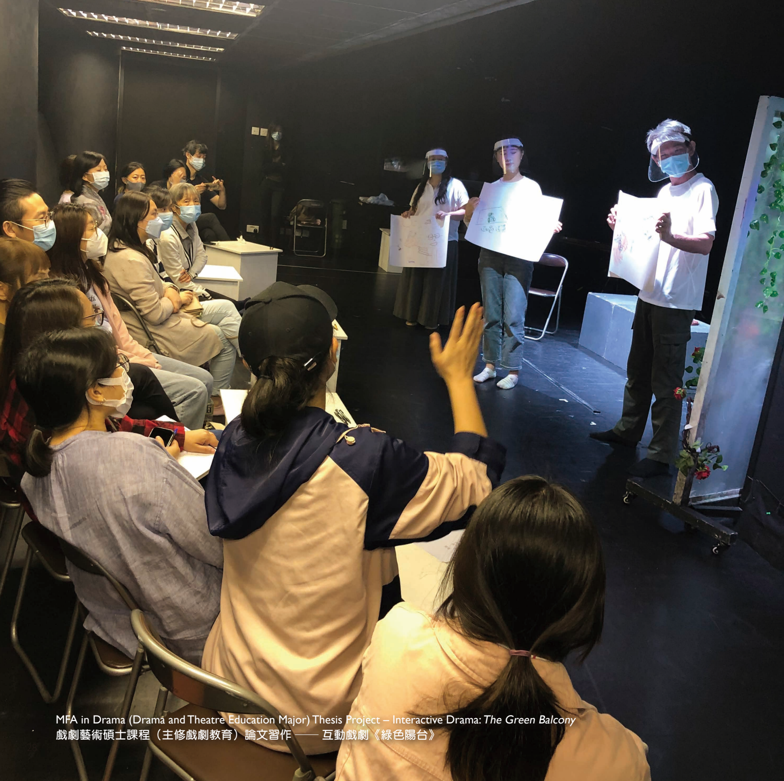
MFA in Drama (Drama and Theatre Education Major) Thesis Project – Interactive Drama: The Green Balcony 戲劇藝術碩士課程（主修戲劇教育）論文習作——互動戲劇《綠色陽台》